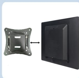
• Standard VESA mount, wall-mounted design