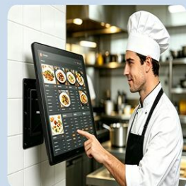
• Supports multi-scenario software perfectly.