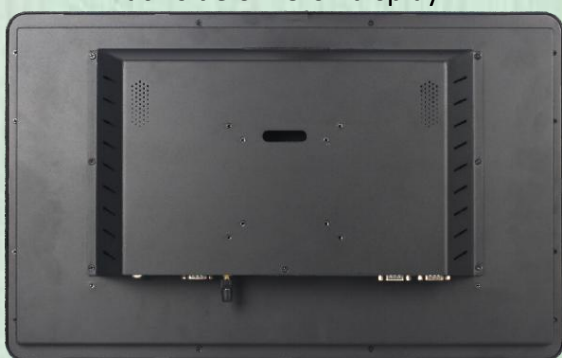
Back side of 21.5" display