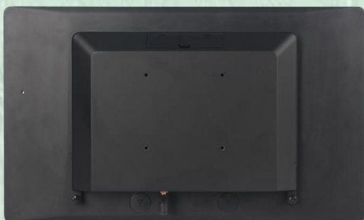
Back side of 15.6" display

15.6" / 21.5" Solid Aluminum Housing Fanless cooling and dust-proof Designed Windows Touch Panel PC