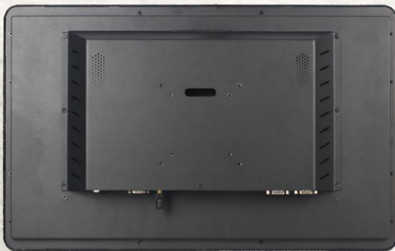
Back side of 21.5" display