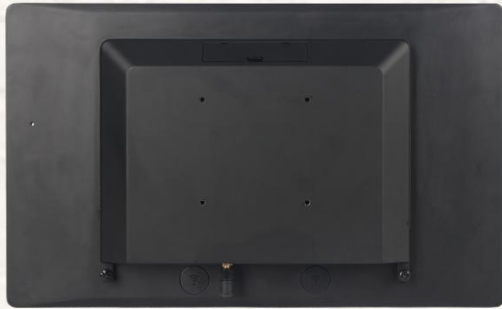
Back side of 15.6" display

15.6" / 21.5" Solid Aluminum Housing Fanless cooling and dust-proof Designed Android Touch Panel PC